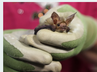
Bat Lady, Jan 11 @ 2 pm