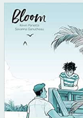
YA Pride Book Club, Jan 15 @ 4 pm