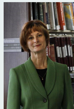
Coffee with the Library Director Jan 30 @ 10:30-11:30 am