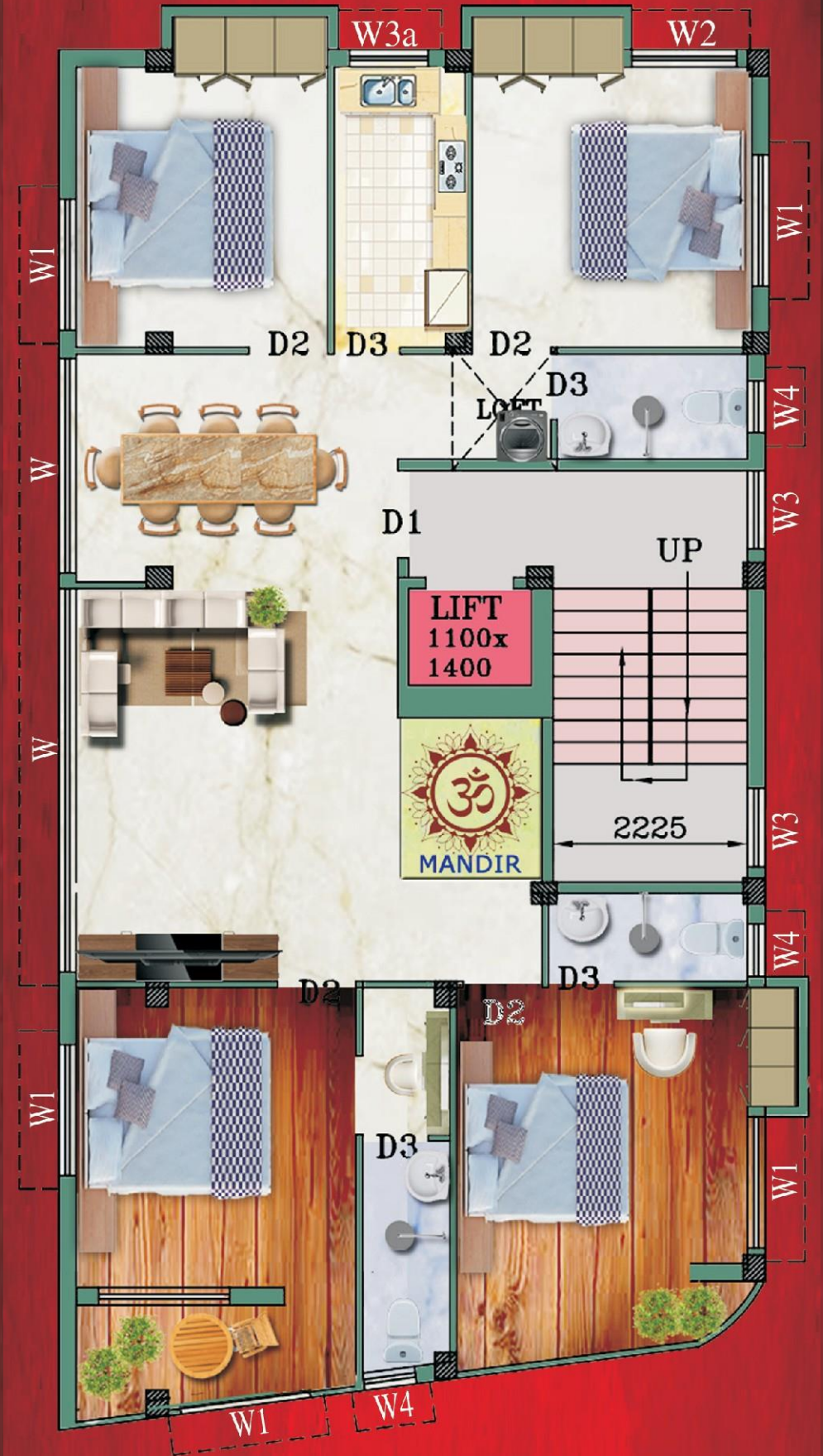
Premises No (41)