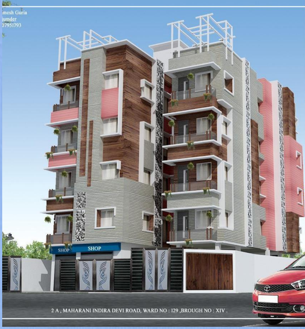
2 A , MAHARANI INDIRA DEVI ROAD, WARD NO : 129 ,BROUGH NO : XIV .

Designed by : Aritra Majumder 9007951793