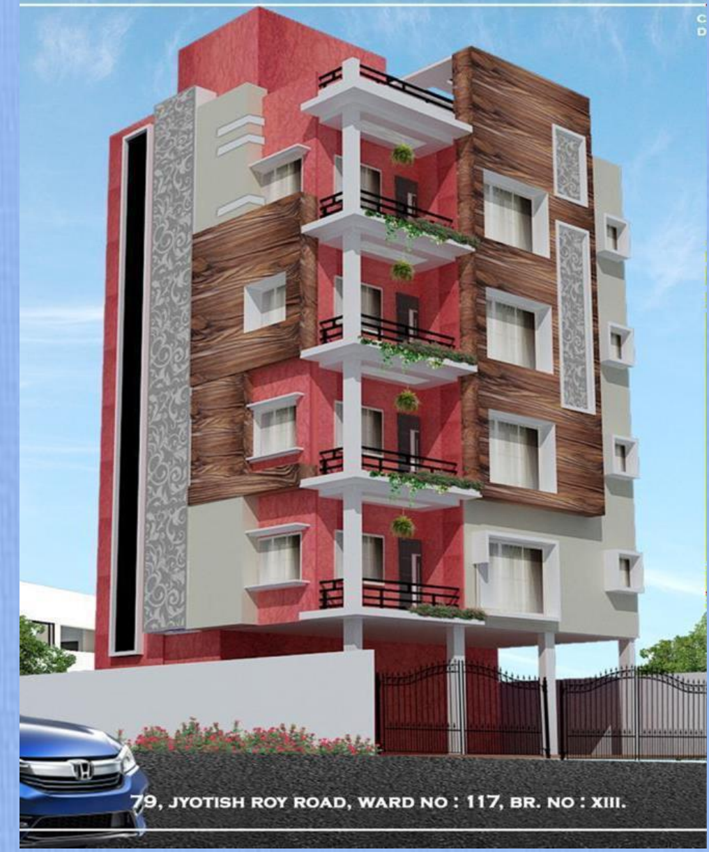
79, JYOTISH ROY ROAD, WARD NO : 117, BR. NO : XIII.