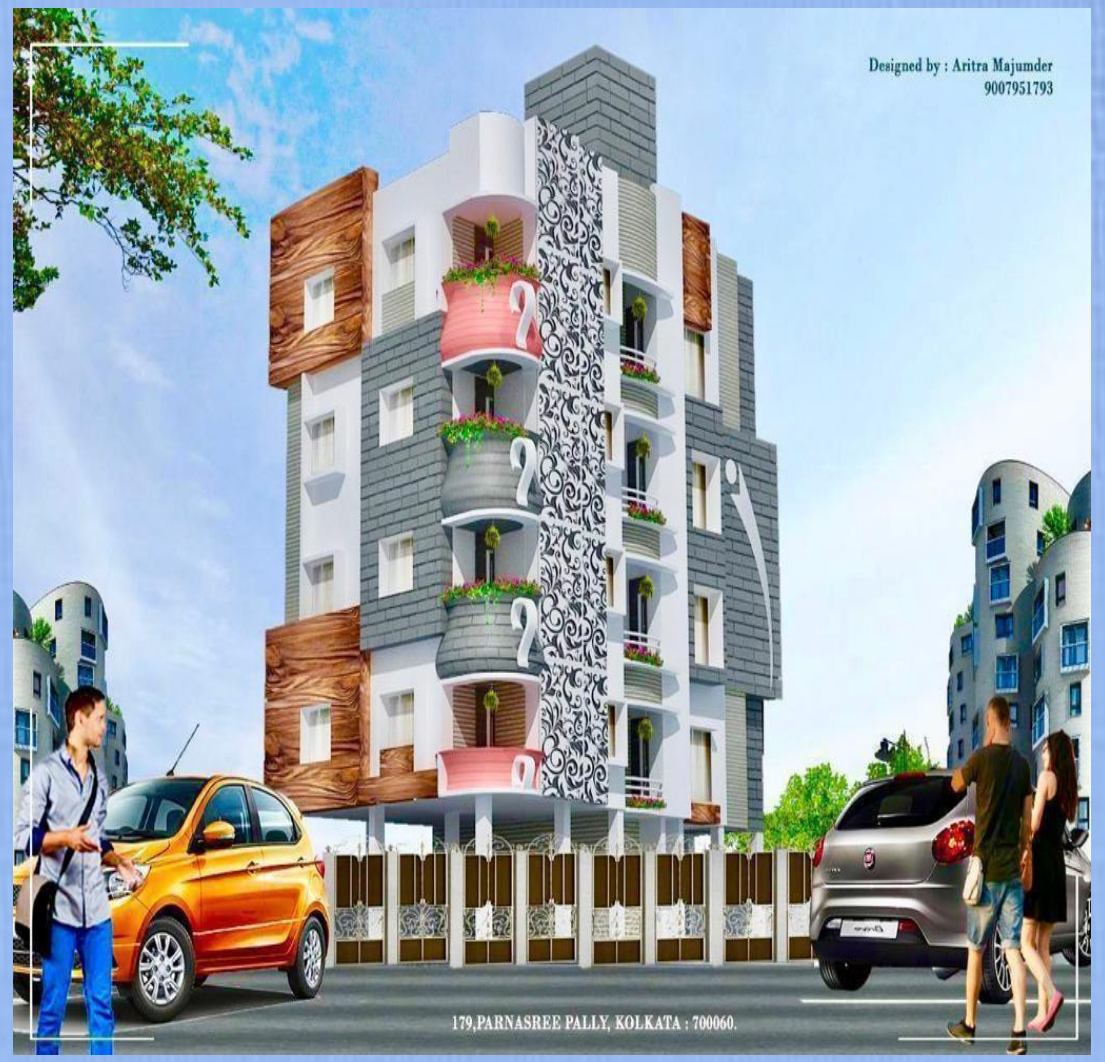
179, PARNASREE PALLY, KOLKATA : 700060.

Designed by : Aritra Majumder 9007951793