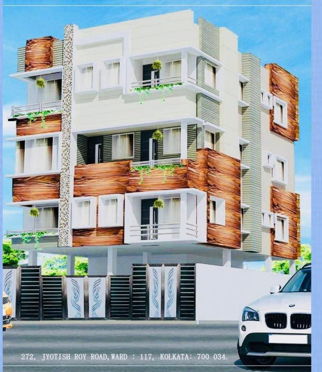
272, JYOTISH ROY ROAD, WARD : 117, KOLKATA: 700 034.