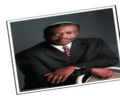
Tidbit: Shelach Lekha

God of our weary years, God of our silent tears, Thou who hast brought us thus far on the way; Thou who hast by Thy might, Led us into the light, Keep us forever in the path, we pray. Lest our feet stray from the places, our God, where we met Thee, Lest our hearts, drunk with the wine of the world, we forget Thee; Shadowed beneath Thy hand, May we forever stand, True to our God, True to our native land.