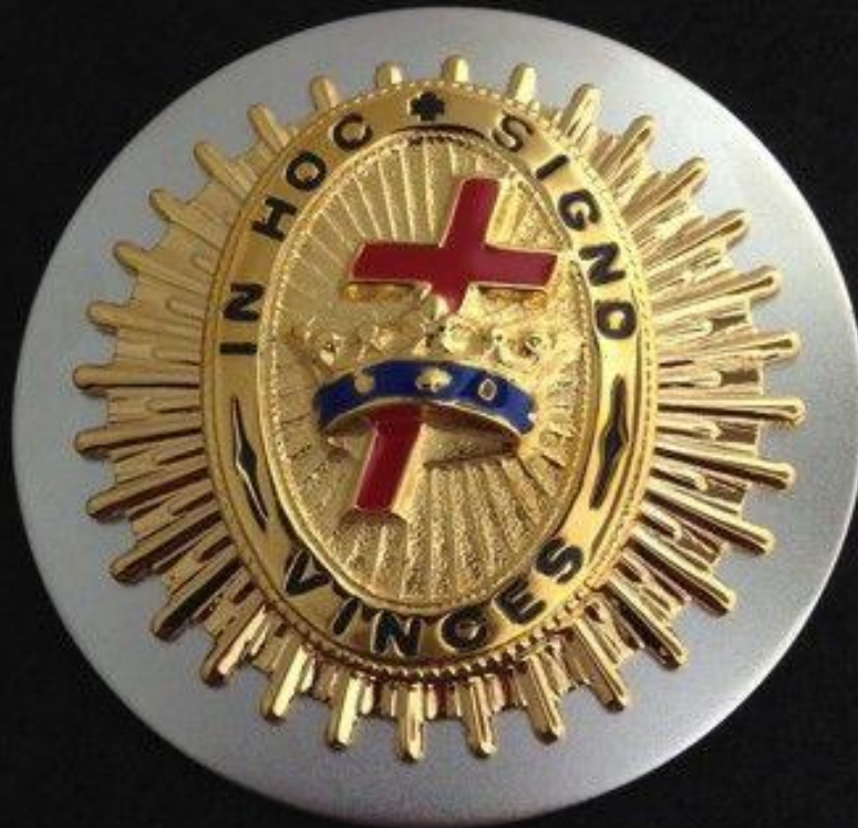
Meeting Will Open In Phoenix Commandery #3

Our meeting are always followed by a social hour, the Knight Cap that is free to all masons, their friends, and family members. This is a time to get to know your brothers on a more personal level and allow your loved ones to participate.