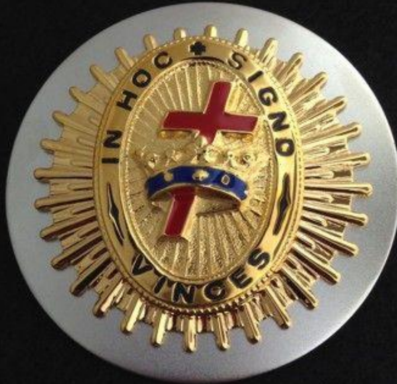
Meeting Will Open In Phoenix Commandery #3

Our meeting are always followed by a social hour, the Knight Cap that is free to all masons, their friends, and family members. This is a time to get to know your brothers on a more personal level and allow your loved ones to participate.