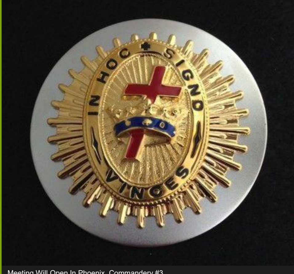
Meeting Will Open In Phoenix Commandery #3

This is a time to get to know your brothers on a more personal level and allow your loved ones to participate.