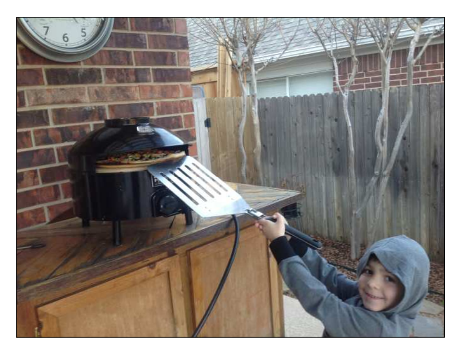
OUR GHRISTMAS GIFT FROM THE GHILDREN AND GRANDGHILDREN