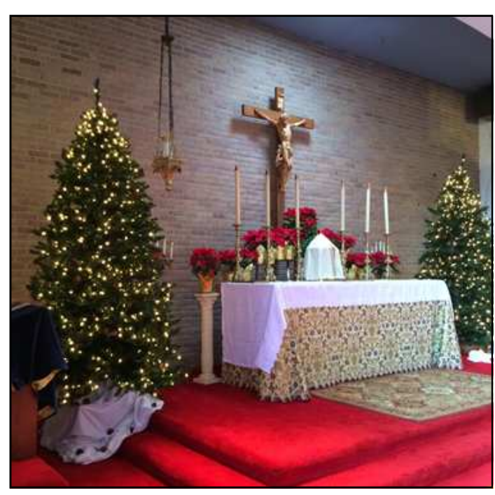
Saint Timothy's Church