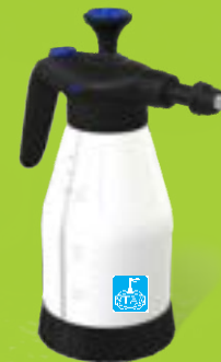
Manual Foam Generator Bottle