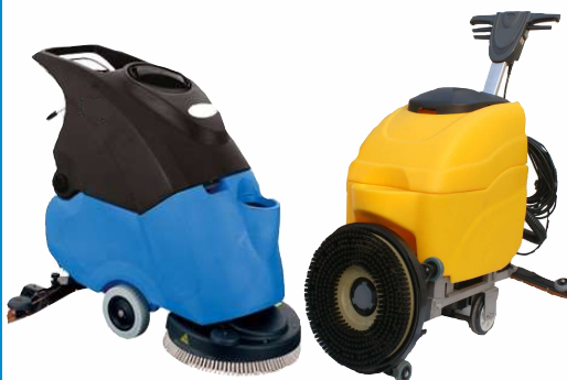
STASMAC PRIME 50

STASMAC GLAZE PRO/PRO HD Series of Single disc heavy duty floor Scrubbing Machines with powerful Motor and low noise helps in achieving the efficient results. STASMAC GLAZE PRO/PRO HD comes with heavy duty stainless steel gears Available in 2 and 2.5 HP variants, suitable for commercial use for area cleaning, scrubbing, polishing, and can be effectively used for crystallization of Marble.