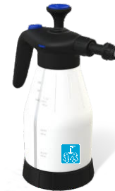
Manual Foam Generenator Bottle