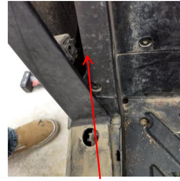
Hidden bolts on both sides

Step 4. Now that both body panels have been removed, you can now start to remove the engine cover. Take some pics of the electrical area. You will need to remove the battery, and disconnect the wiring as it will be pulled through the panel for removal.