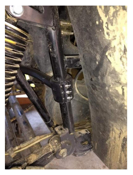
Do not tighten the Allen bolts until they are all started evenly. You will still be able to gain access to the air filter with this hitch.