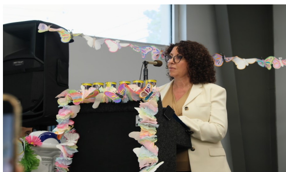
Mayor Brenda Bethune