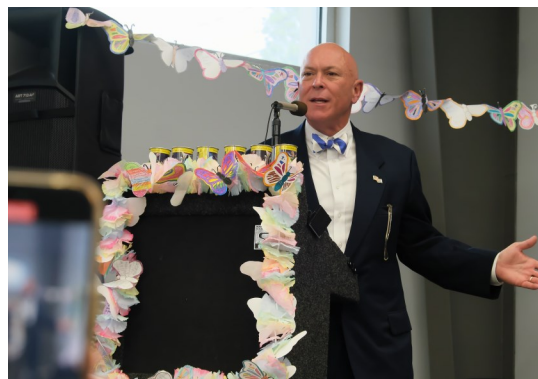
Judge Alan Clemmons