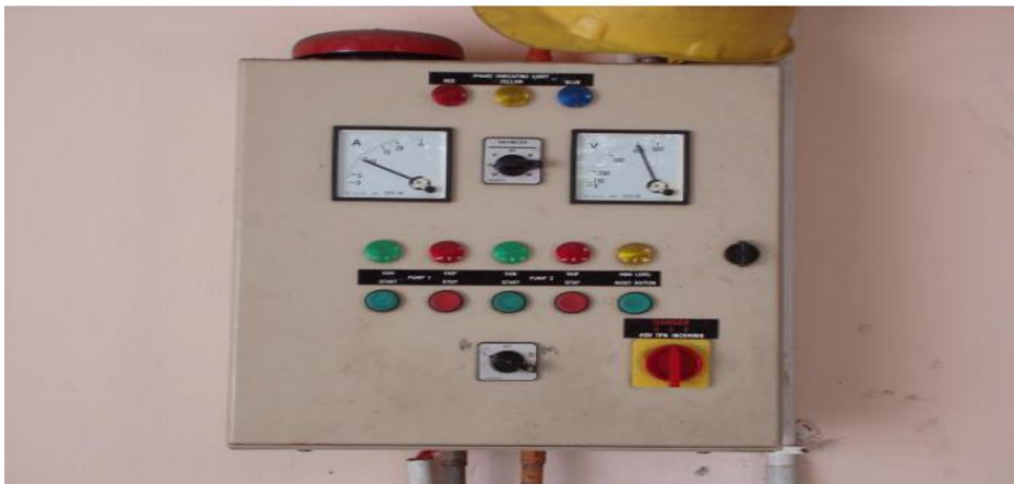
DAMANSARA SPECIALIST HOSPITAL (SEWERAGE SUMP PUMP)