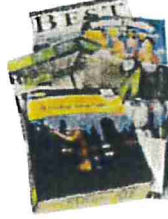
Magazines, catalogs and telephone books