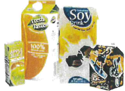
(caps and straws removed)