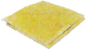
Cardboard (flattened to fit in your bin or cart)