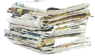
Newspaper, including inserts