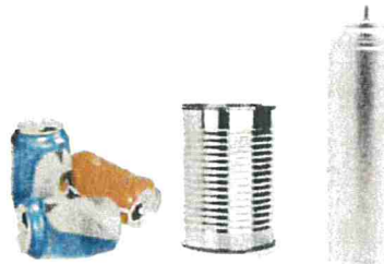
Aluminum cans, steel & tin cans