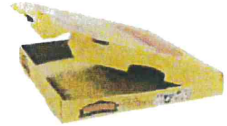
Clean Pizza Boxes