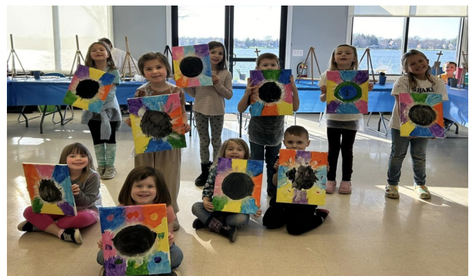
Kids Solar Eclipse Paintings