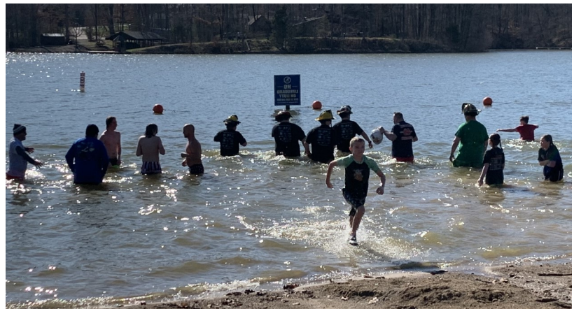
Gaspar Fire & EMS Polar Plunge