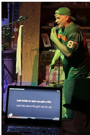
Open Mic & Karaoke