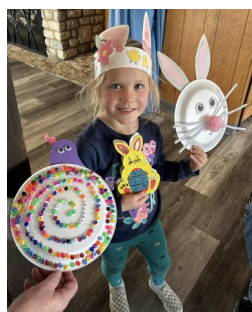
Kids Easter Crafts