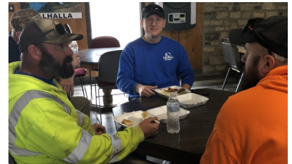
Staff & BOT Appreciation Lunch