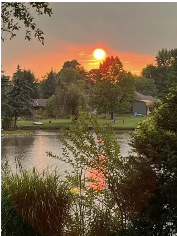
Sunset on beautiful Thor Lake in June