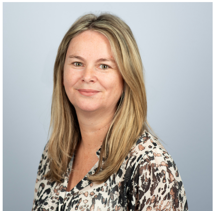
YOUR HR EXPERT