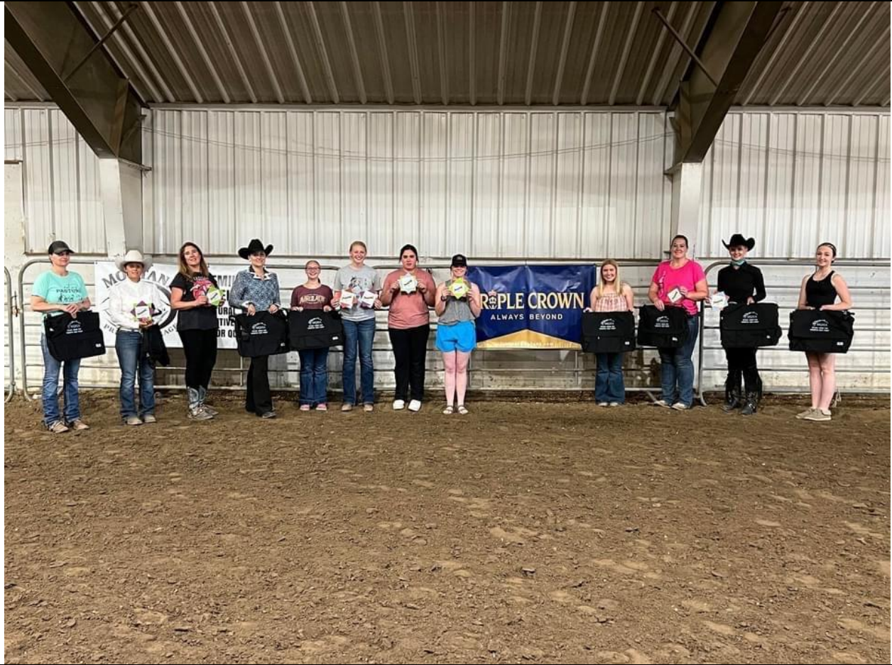
High Point and Reserve High Point winners with our MQHA sponsor banners from Montana Forage and Triple Crown Feeds