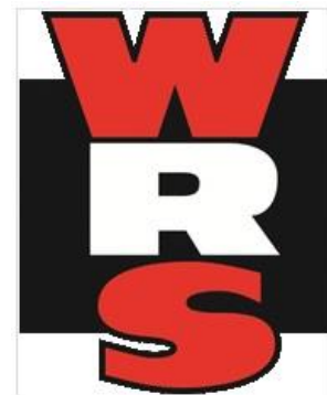
WESTERN RANCH SUPPLY