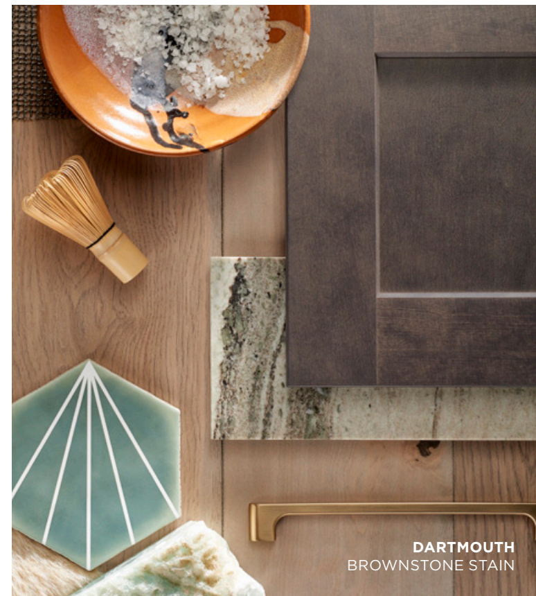
DARTMOUTH BROWNSTONE STAIN