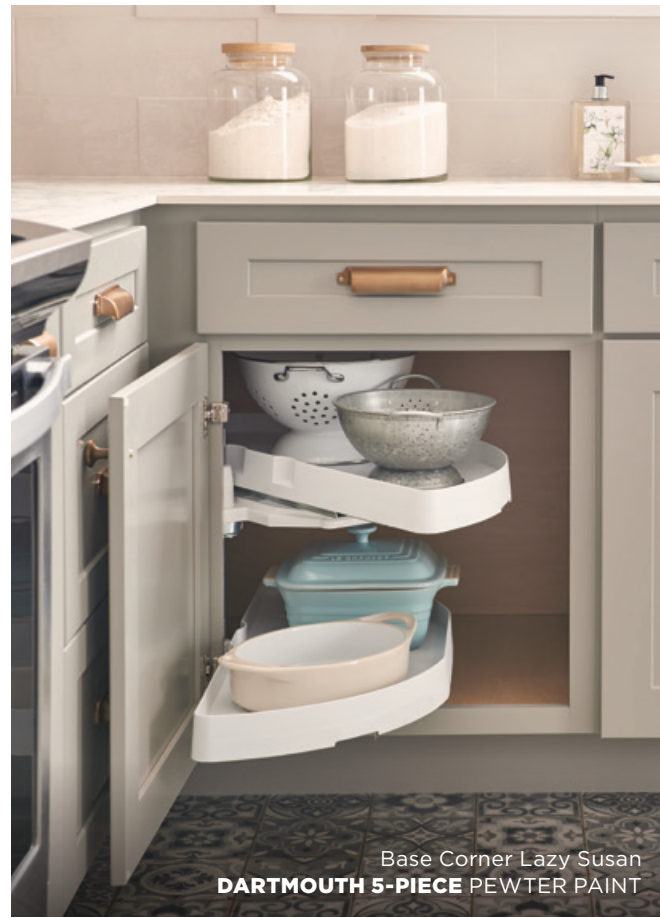
Base Corner Lazy Susan DARTMOUTH 5-PIECE PEWTER PAINT