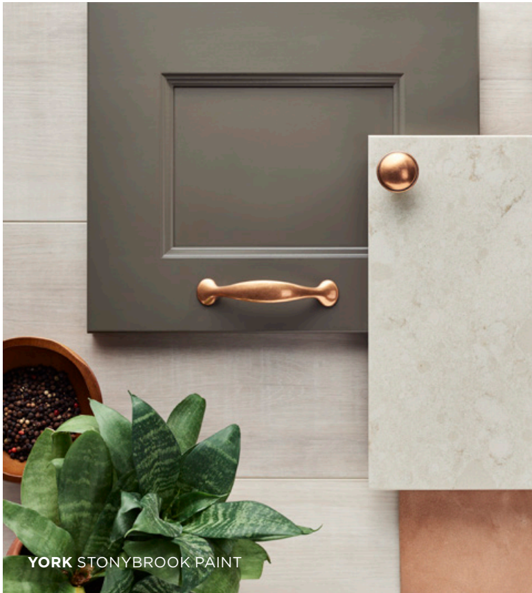
YORK STONYBROOK PAINT