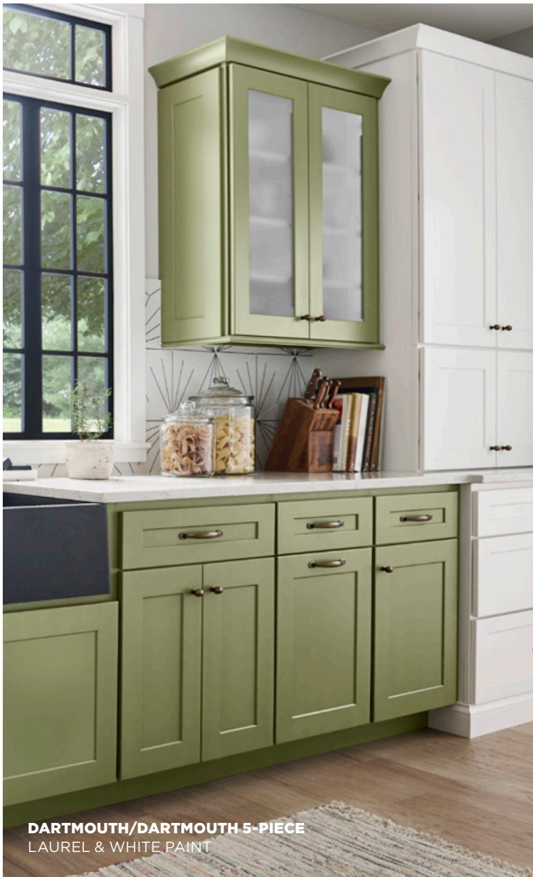
DARTMOUTH/DARTMOUTH 5-PIECE LAUREL & WHITE PAINT