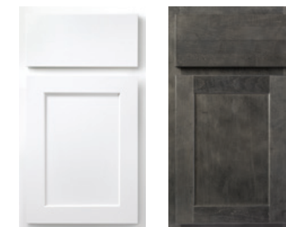
White Paint Grey Stain