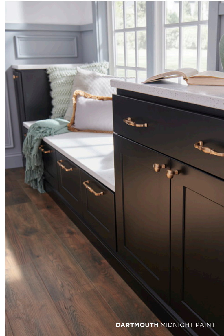
DARTMOUTH MIDNIGHT PAINT