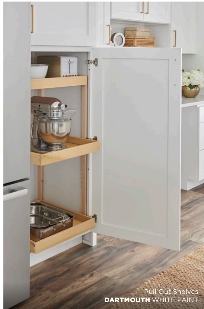
Pull Out Shelves DARTMOUTH WHITE PAINT