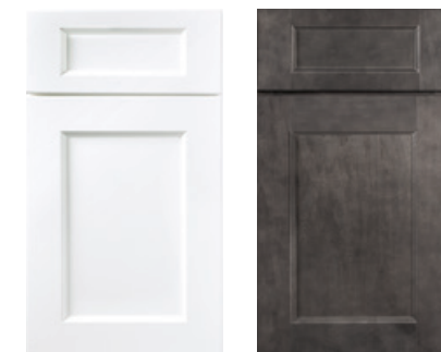
White Paint Grey Stain