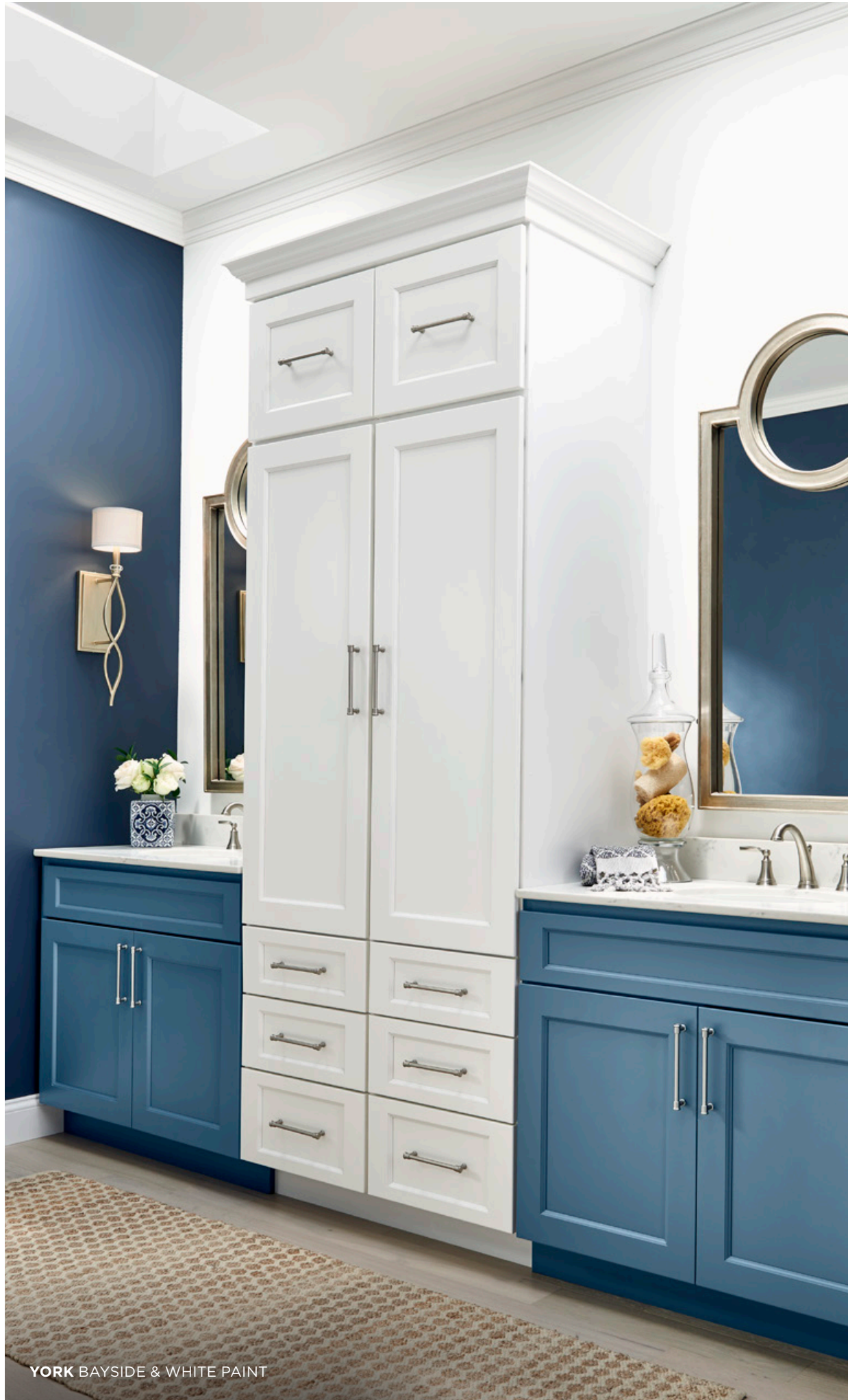
YORK BAYSIDE & WHITE PAINT