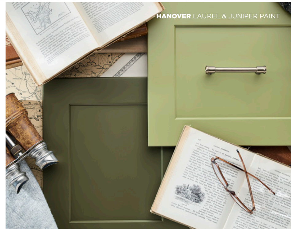
HANOVER LAUREL & JUNIPER PAINT

Personalized Solutions gives you more design flexibility with Wolf Classic cabinets so you can: