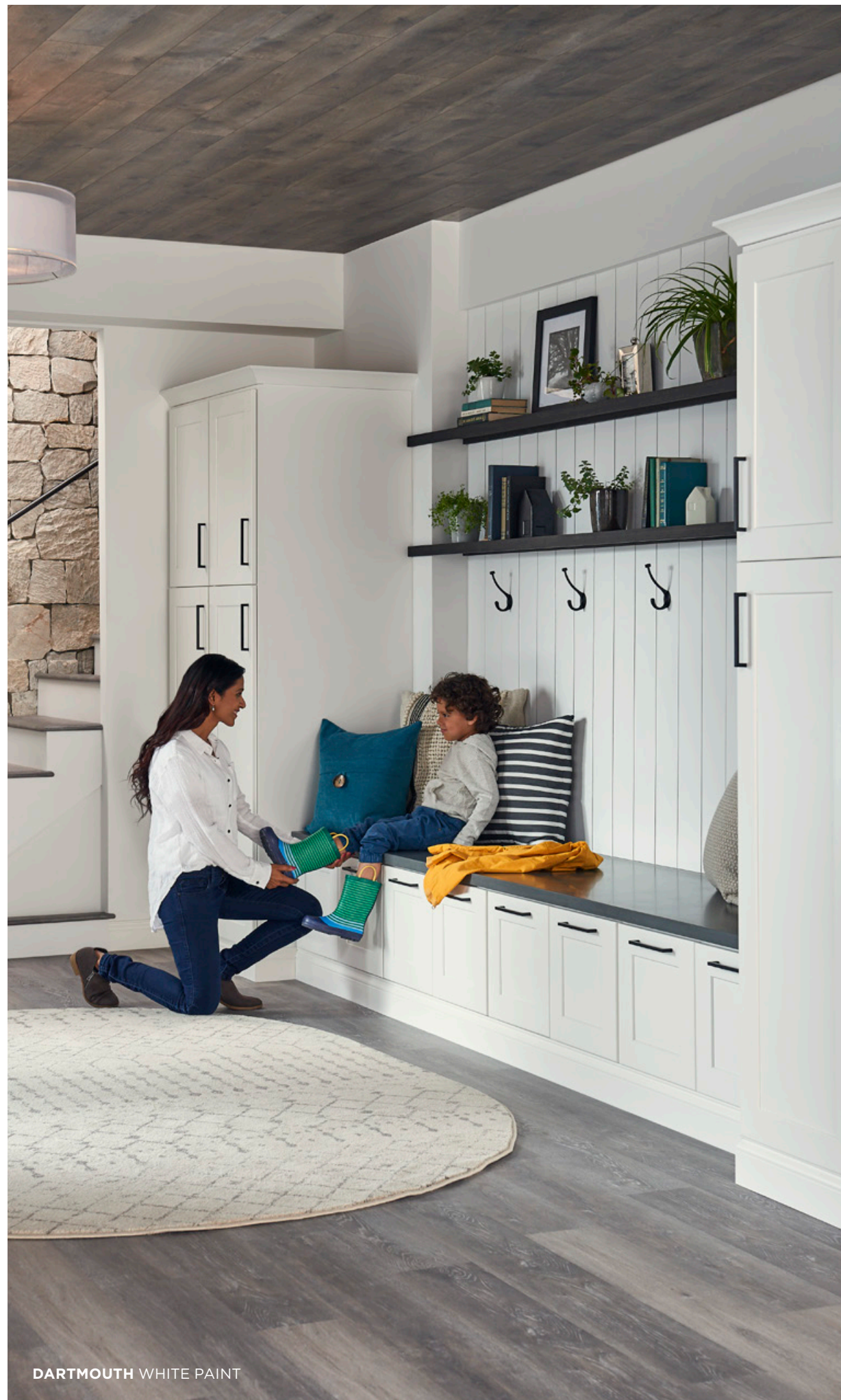
DARTMOUTH WHITE PAINT