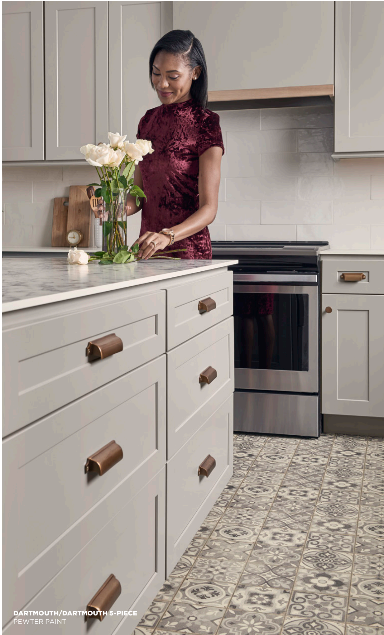
DARTMOUTH/DARTMOUTH 5-PIECE PEWTER PAINT