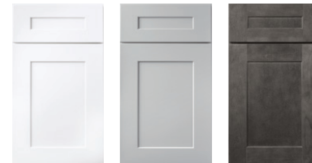
White Paint Pewter Paint Grey Stain