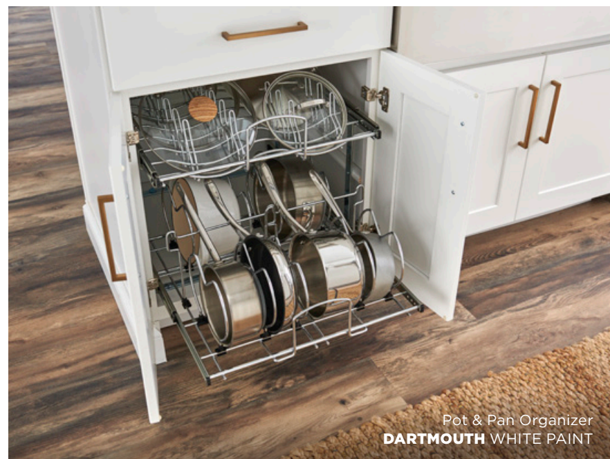
Pot & Pan Organizer DARTMOUTH WHITE PAINT