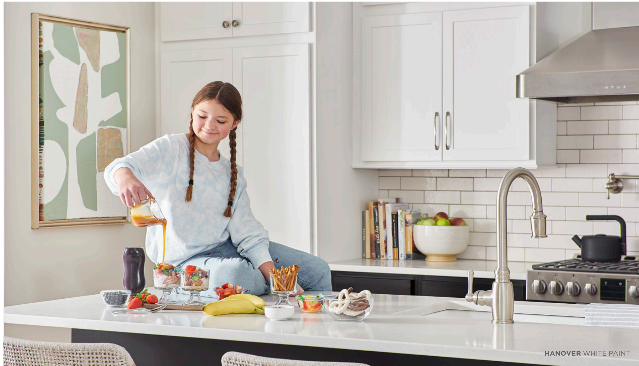
HANOVER WHITE PAINT