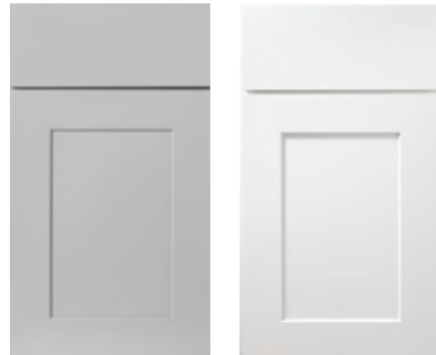
Pewter Paint White Paint

Also available in nine special order finishes. See page 32 to learn more about WOLF CLASSIC™ COMPLEMENTS