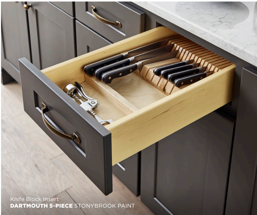
Knife Block Insert DARTMOUTH 5-PIECE STONYBROOK PAINT