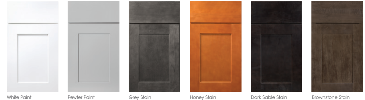
White Paint Pewter Paint Grey Stain Honey Stain Dark Sable Stain Brownstone Stain