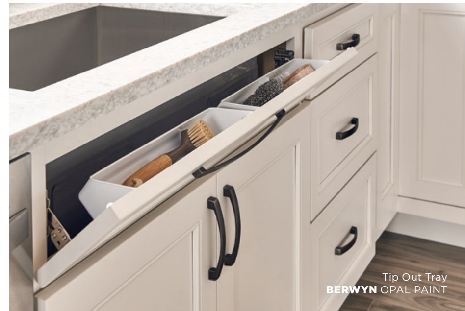
Tip Out Tray BERWYN OPAL PAINT

With this program, Wolf Classic becomes a complete cabinetry solution – so not only can you make a customized design statement, but you'll also enjoy extra design flexibility, easily accommodate the character of your space and incorporate the latest trends in vibrant colors – all in a fraction of the time. Just think outside the box.