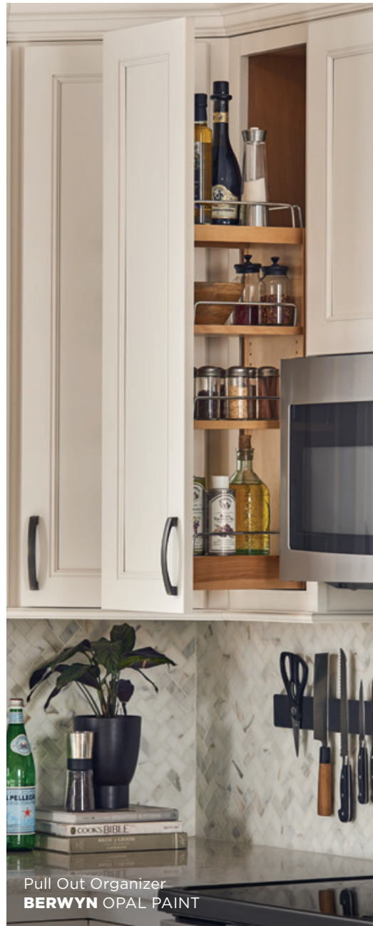
Pull Out Organizer BERWYN OPAL PAINT