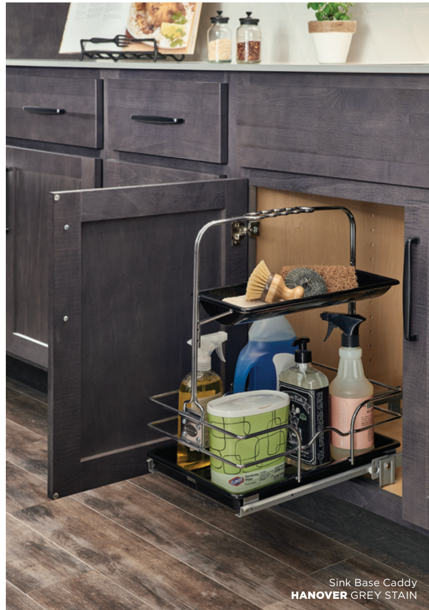
Sink Base Caddy HANOVER GREY STAIN