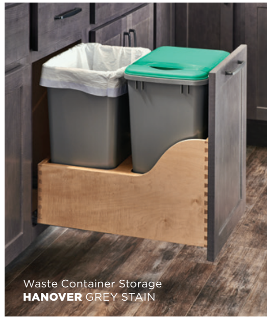
Waste Container Storage HANOVER GREY STAIN