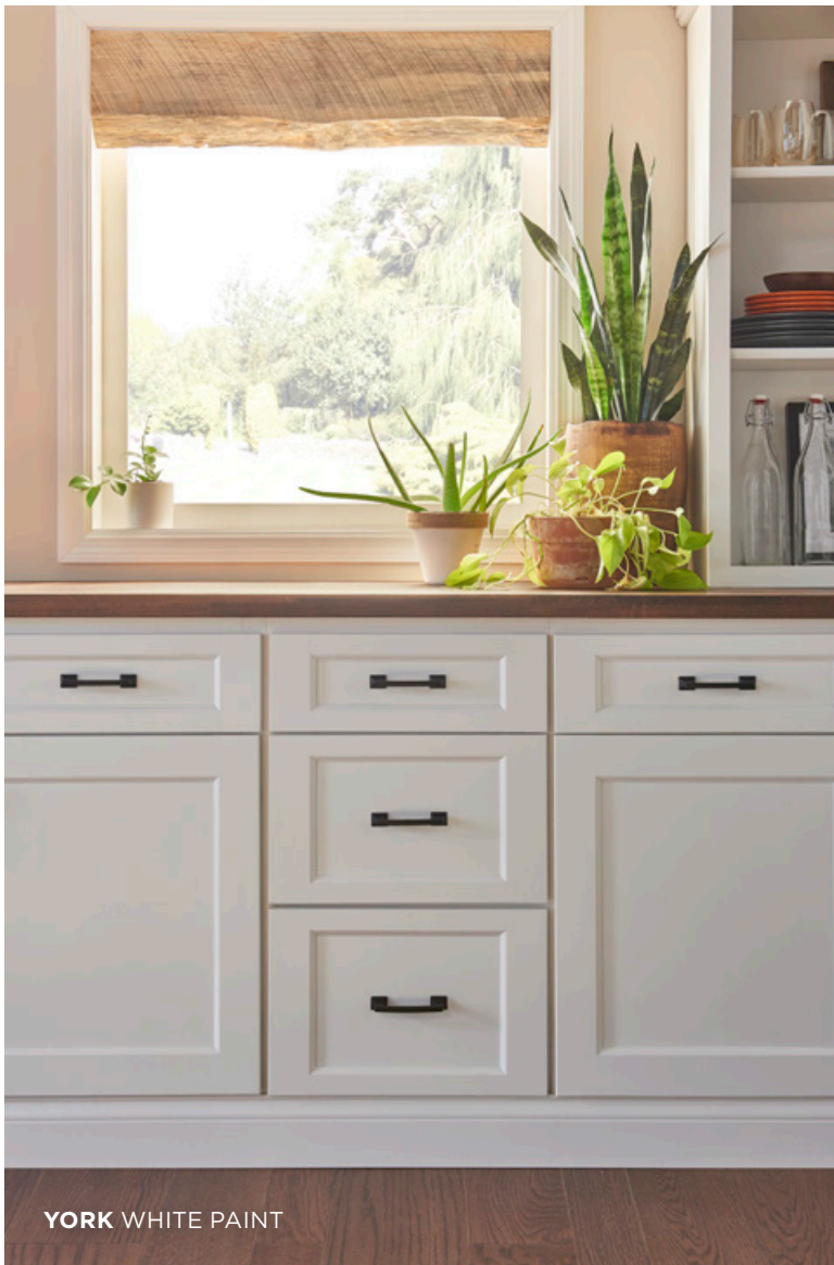
YORK WHITE PAINT