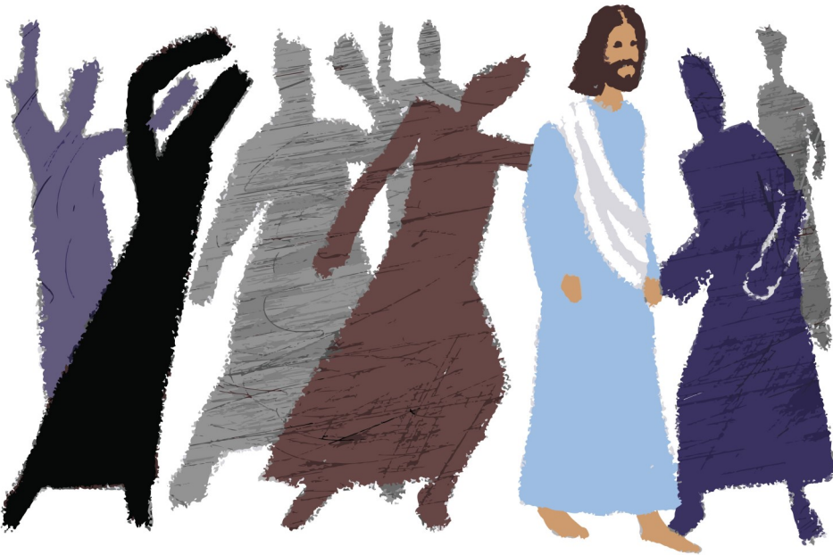
An Angry Crowd Tries to Throw Jesus Off a Cliff