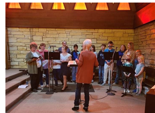
Our CCD kids participating in our 1st "Children's Mass" Everyone did an exceptional job!