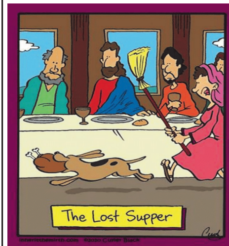
"The Lost Supper"