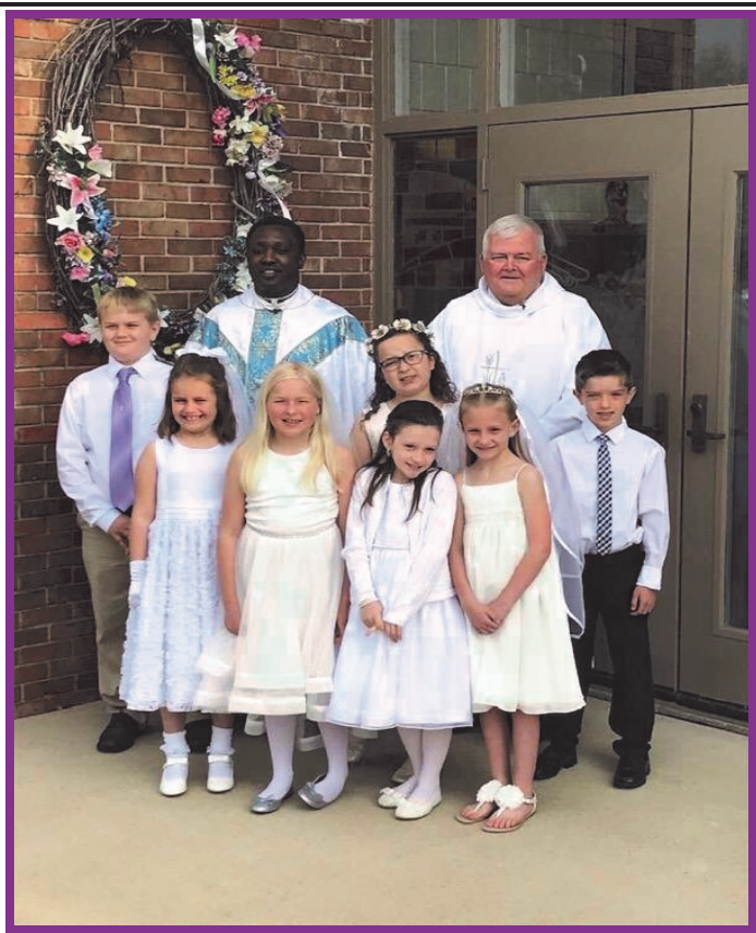
First Holy Communion-SS Philip & James-Grand Mound