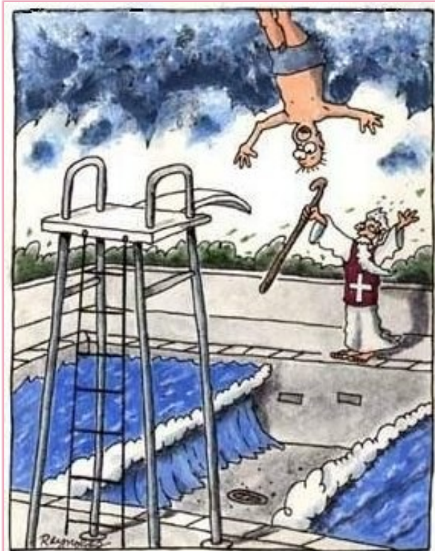
Moses' first and last day as a lifeguard.