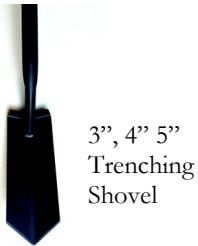
3", 4" 5" Trenching Shovel