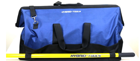
40" Carrying Bag with handle holder