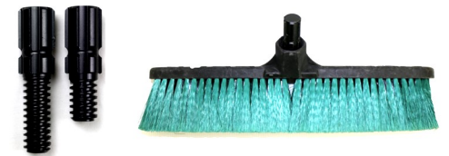
ACME Thread Tool Adapters 3" & 4"