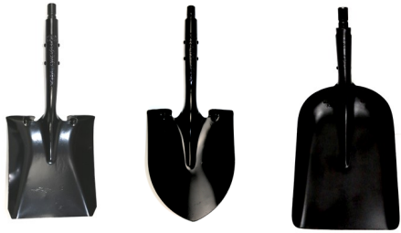
Flat Shovel & Spade with Large Foot Steps Lg Scoop Shovel