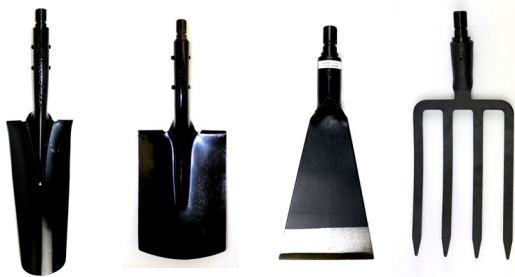
Post Hole Shovel Flat Spade 7' Scraper Flat Pitchfork