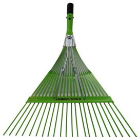
Spring Rake, Leaf, Rock & Grass