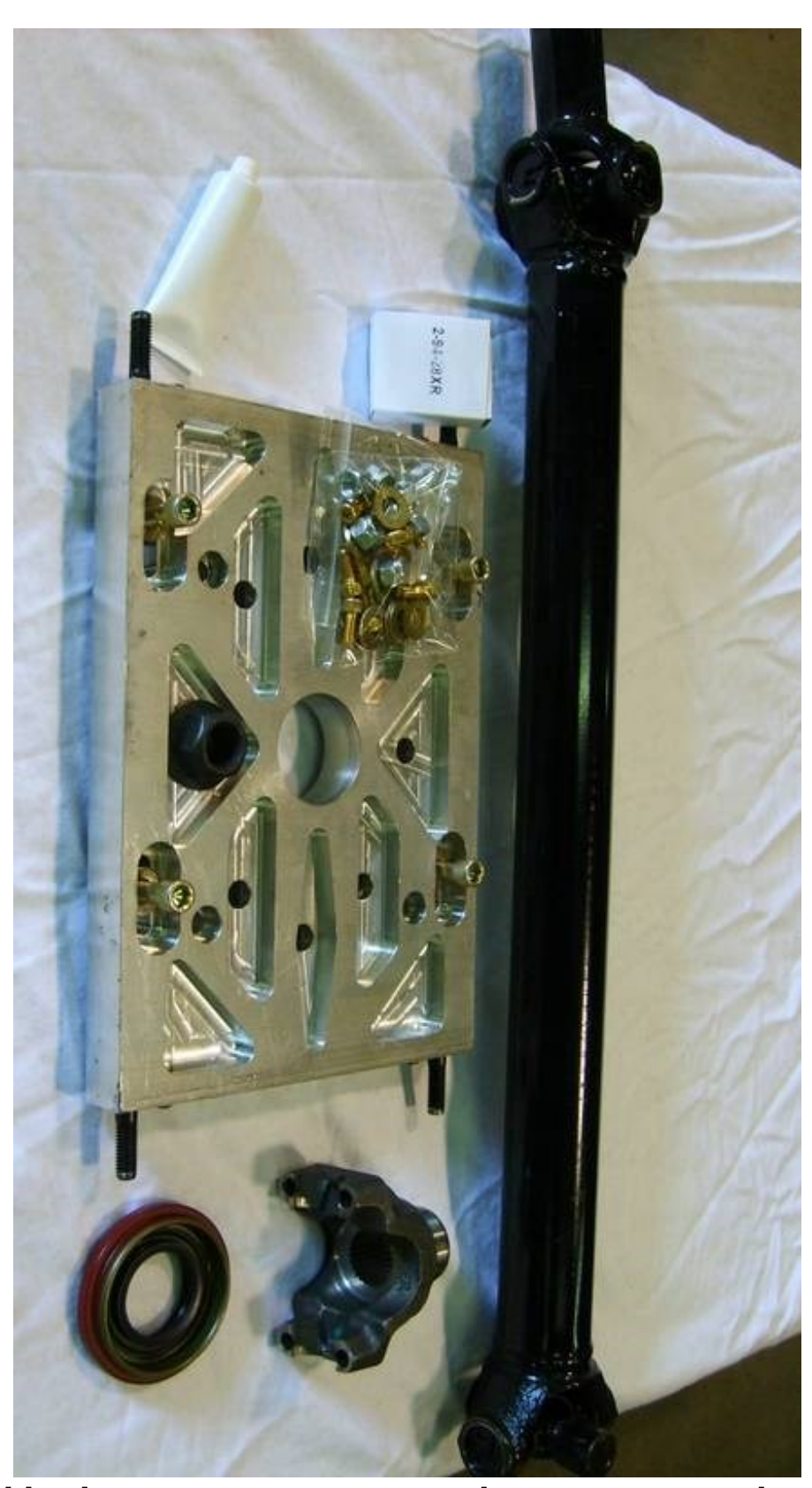
(this photo may not represent the parts you received)