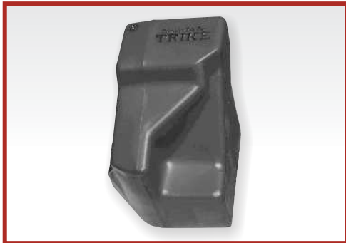
3.4 Gallon Auxiliary Fuel Tank