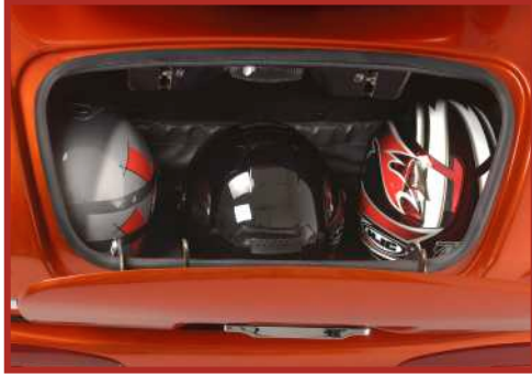
8 cu ft of Trunk Storage Capacity

The COBRA is a trike designed from the ground up to deliver superior performance, ride and safety. At its core is a race-honed, fully independent suspension system that smoothes the roughest roads while providing responsive handling to the driver. And now the industry's #1 selling trike kit for the Goldwing 1800 just got even better with the new CobraXL which doubles the trunk storage capacity to 8 cubic feet without sacrificing styling.