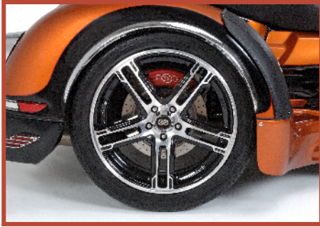
17" ENKEI Wheel Performance Brake Upgrade*

The CSC Daytona Kit is designed specifically for Harley-Davidson Touring Motorcycles. It's uniquely designed body is a great compliment to the styling features of the H-D Motorcycle and sets itself apart from other Trike kits. Our independent suspension and Power Trak combination gives superior ride, handling and comfort compared to other kits and even OEM Trikes.