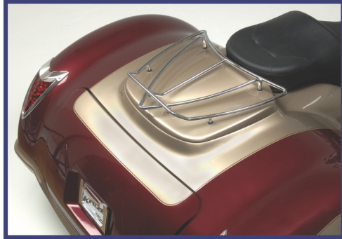
Optional Luggage Rack

Introducing California SideCar's first trike for the Kawasaki brand of motorcycles. This unique trike body compliments the styling features of the motorcycle from the fuel tank lines to the tear-drop style tail lights of the Voyager and Nomad models.