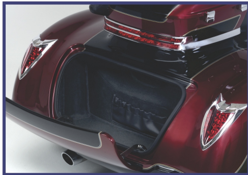
8.1 cu. ft. Storage Capacity