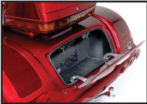
8 cu ft. of Trunk Storage Capacity

Our customers spoke and we listened. Introducing the new Goldwing GL1500 trike with Independent Suspension. Re-engineering the suspension from a straight axle to a race-honed, fully independent suspension system delivers a trike kit with absolute performance, style and comfort - one worthy of Goldwing's legendary performance. The look and styling of the GL1500 are further complimented by CSC's industry leading designs.