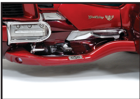
Optional Ground Effects