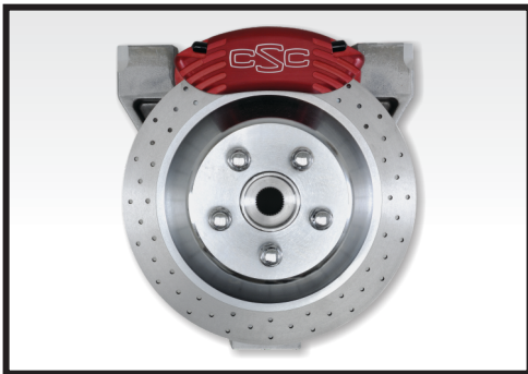
Performance Brake Upgrade