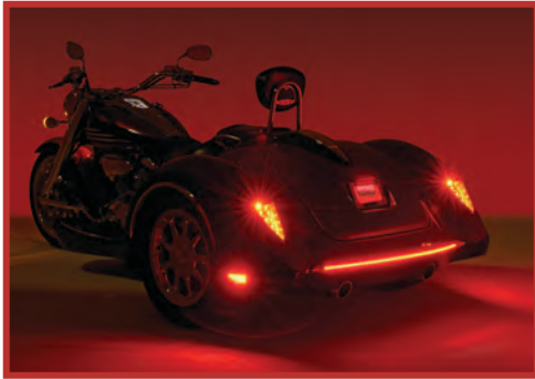
Night View with LED Tail Lights and Light Bar

Introducing the industry's first trike kit for the Yamaha Roadliner/Stratoliner models. The trike body incorporates chrome accents from the fuel tank, while maintaining the spoke wheel look and teardrop style LED tail lights of the original motorcycle design. The result is classic CSC styling, rolled into a retro style hotrod look, enhancing the Roadliner/Stratoliner series from Yamaha motorcycles.