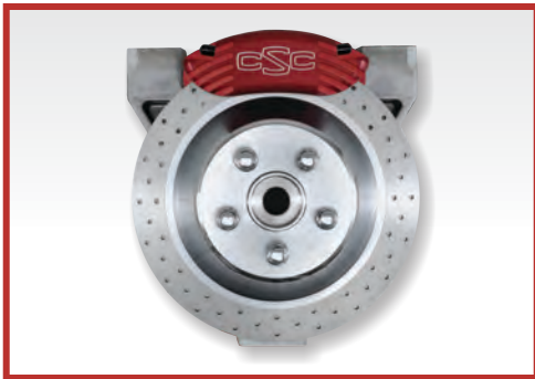
Optional Performance Brake