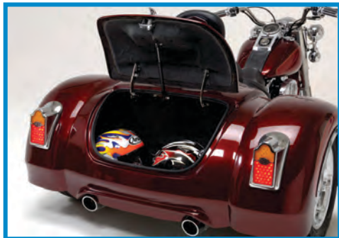
6.5 cu ft of Trunk Storage Capacity

Following the classic lines of the Harley Davidson Softail the CSC Volusia trike is designed for cruising in style. With it's low center of gravity, stiff chassis and proven CSC Independent Suspension, the Volusia is a great handling and sporty ride, whether cruising or touring.