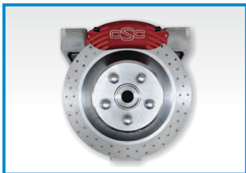
*Performance Brake Upgrade