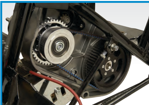
*Electric Belt-Drive Reverse