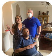
Houston Health Plan Member