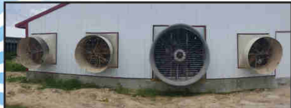
78-inch Mega Fan compared to 50-inch fans