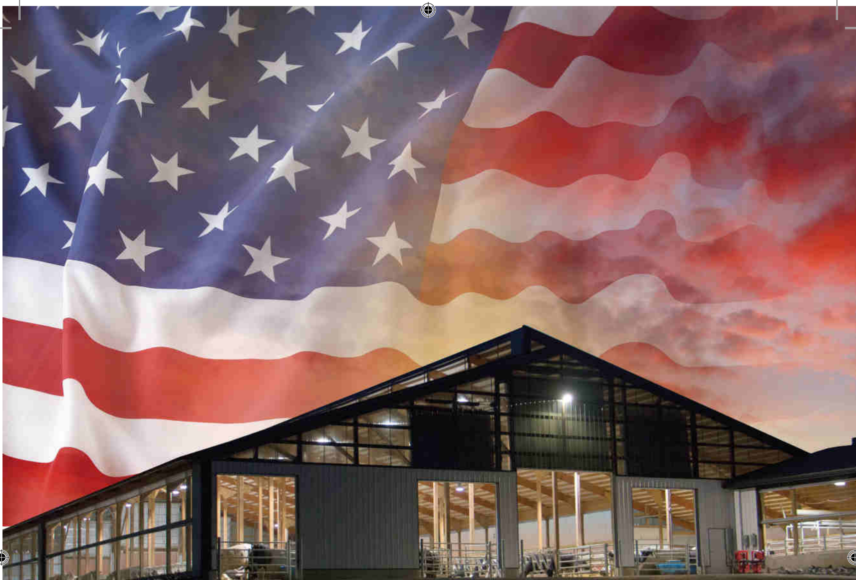
Ciolkosz Farm of Thorp, Wisconsin