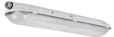
LEDWI-VT02 ALL WATTS

Universal 120-277 VAC | Die-cast aluminum, corrosion-resistant | Dark bronze, white, or black polyester, powder-coat finish | LM-80 certified high performance and reliable | Mounting: Surface and V-Hook Pendant | UL Damp location | Operating temp: -40°F to 104°F