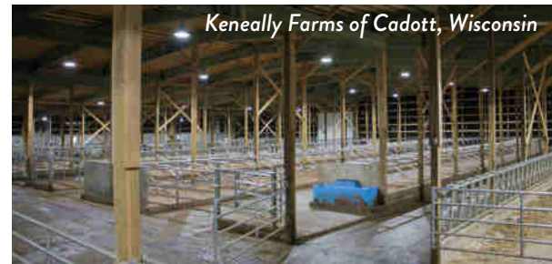
Keneally Farms of Cadott, Wisconsin