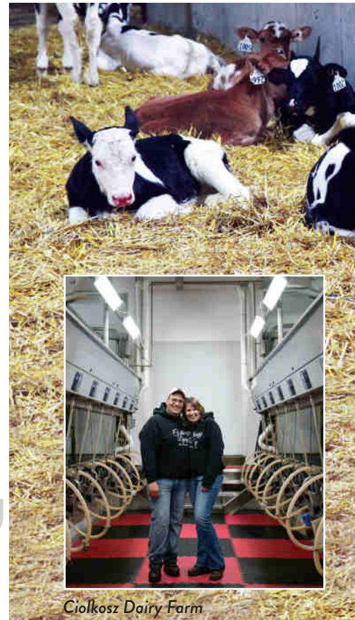
Ciolkosz Dairy Farm