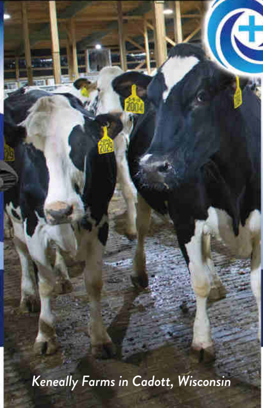
Keneally Farms in Cadott, Wisconsin