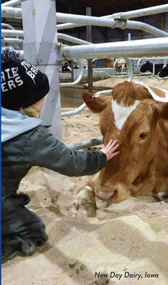
New Day Dairy, Iowa