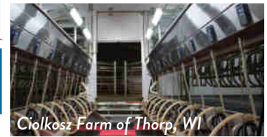
Ciolkosz Farm of Thorp, WI

Universal 120-277 VAC | Die-cast aluminum, corrosion-resistant | Dark bronze, white, or black polyester, powder-coat finish | LM-80 certified high performance and reliable | Mounting: Surface and V-Hook Pendant | UL Damp location | Operating temp: -40°F to 104°F