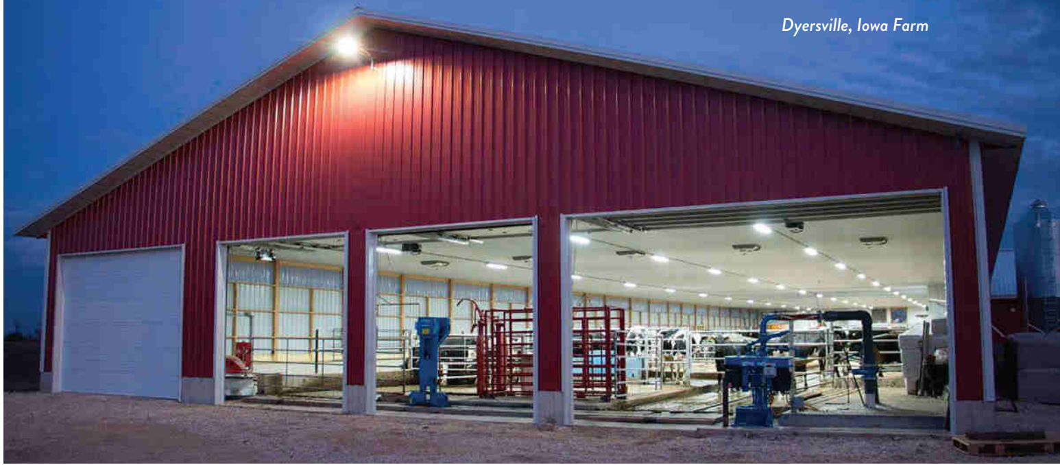
Dyersville, Iowa Farm