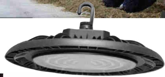
150W HIGH BAY LEDWI-HBX