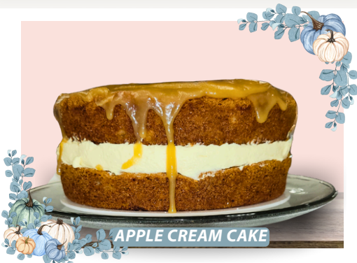
APPLE CREAM CAKE

Pumpkin Cookies $ 8.65 Doz. Our made-from-scratch Pumpkin Cookies frosted with our special Brown Sugar Icing.