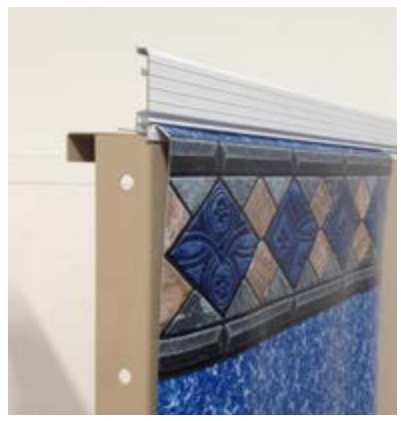
ALUMINUM BENDABLE BULLNOSE

(Above ground, Semi-Inground or Inground)