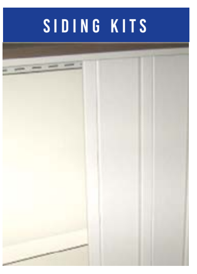
Optional Batten Board Vertical Siding kits are available for round above ground and semi-inground applications only.