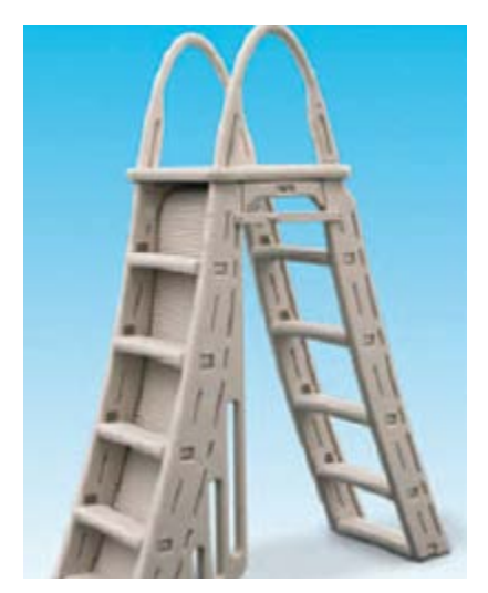
A-FRAME: The roll-guard A-frame safety ladder is needed for Ultimate Pool Kits. This ladder meets ANSI/APSP Barrier requirements.