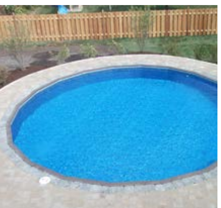
STANDARD ROUND SIZES: 15', 18', 21', 24', 28'