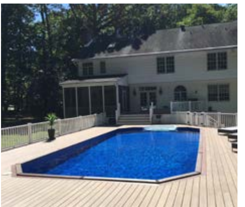
STANDARD GRECIAN SIZES: 12' x 24', 18' x 36', 20' x 40' 14' x 30', 16' x 32'