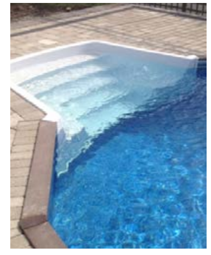
Walk-In® Stair makes an easy and beautiful way to enter and exit your pool. It's made from tough, durable material that withstands earth movement and severe climate changes.