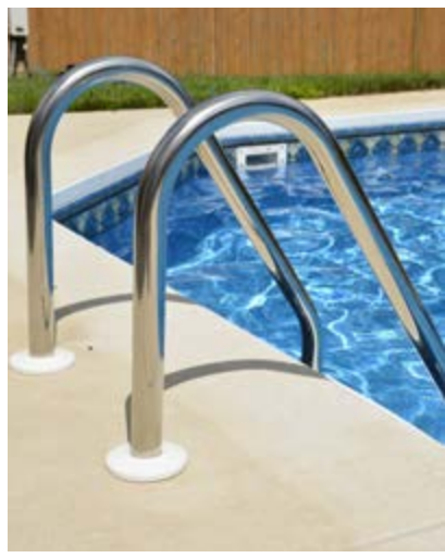
DECK LADDER: For Inground installation, a deck ladder is needed.