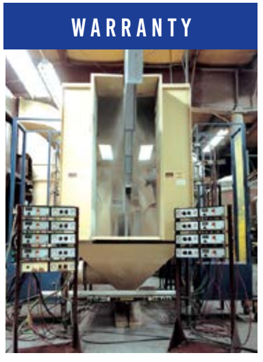
Our state of the art epoxy powder coating system provides long lasting protection from corrosion, and is backed by a limited lifetime warranty.