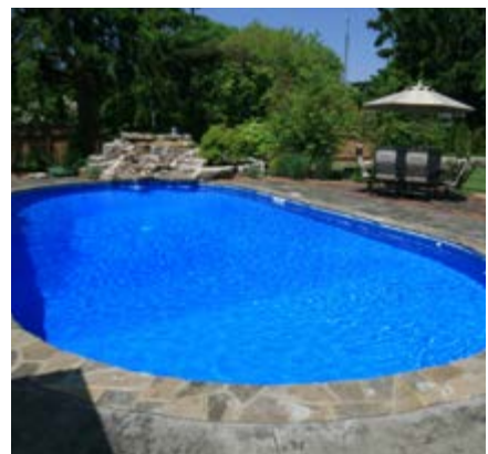
STANDARD OVAL SIZES: 15' x 24', 15' x 30', 17' x 32'