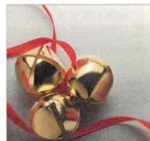
Polar Express kids event at the clubhouse Saturday at 2:00pm