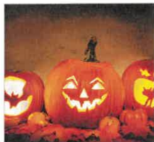
Halloween Trunk or Treat at Harvest Lake Recreation Area 2:00pm