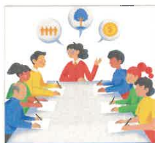
Annual Member's Meeting at Coventry Elementary School with prizes! Check In 6:45pm