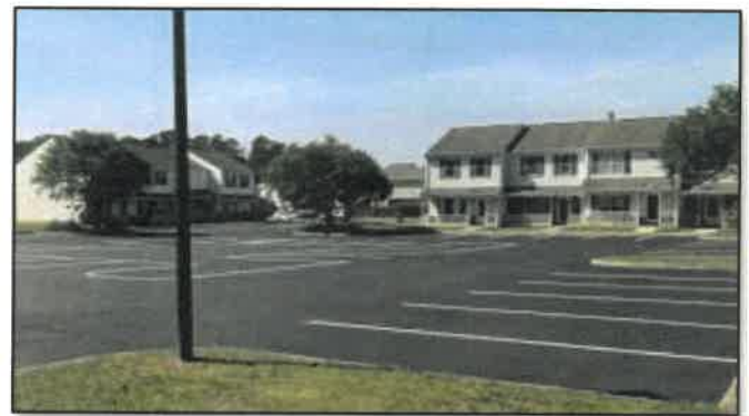
Thanks to the Board for scheduling the Milling and Paving of our Streets in April 2023. What a difference this has made in the overall appearance of the neighborhood!