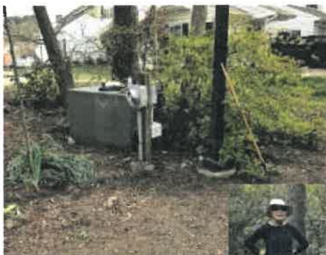
Remember this eyesore along the walking path behind Hamlet Court?

If you are unable to do these tasks on your own, or are an owner wanting to provide this service for your renter, please don't hesitate to reach out to a reliable lawn contractor for assistance. The Vine is our lawn contractor for Smithy Glen and provide good service to us and are more than willing to come give you a quote for any service you need, mulching, shrub trimming, gutter cleaning, etc. They can be reached at (757) 561-2212.