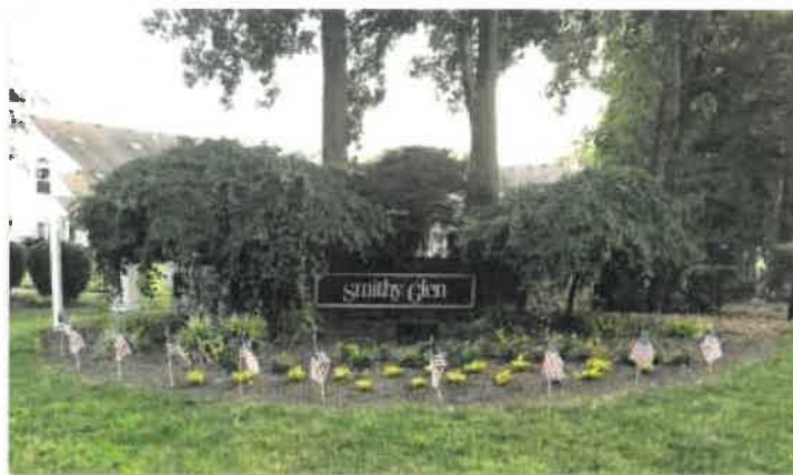
Smithy Glen Monument is Decorated for the 4 th of July

SG Policy Resolution #2022-3, dated 1 Sept 2022 , states that no electric vehicle charging stations will be erected on Smithy Glen property (parking and grass areas). Additionally, no vehicle charging cord shall cross any sidewalk, or visible to any neighboring properties, causing a tripping hazard.