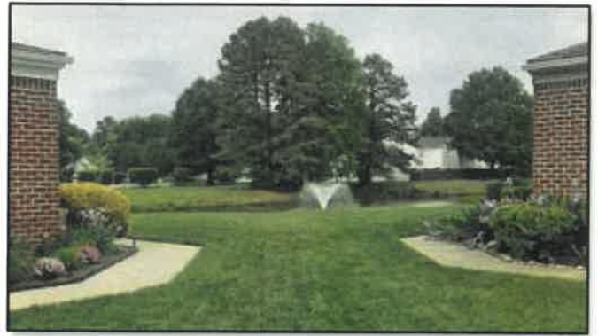
A Beautifully Landscaped area in Smithy Glen.