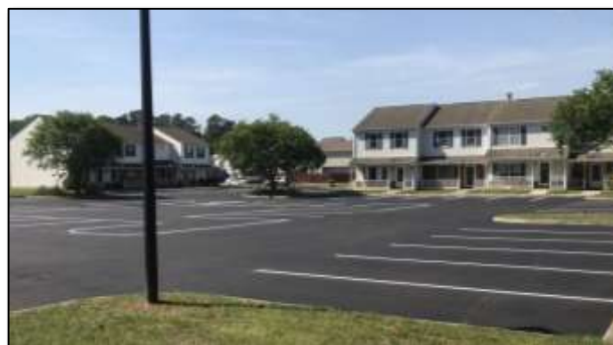
Thanks to the Board for scheduling the Milling and Paving of our Streets in April 2023. What a difference this has made in the overall appearance of the neighborhood!