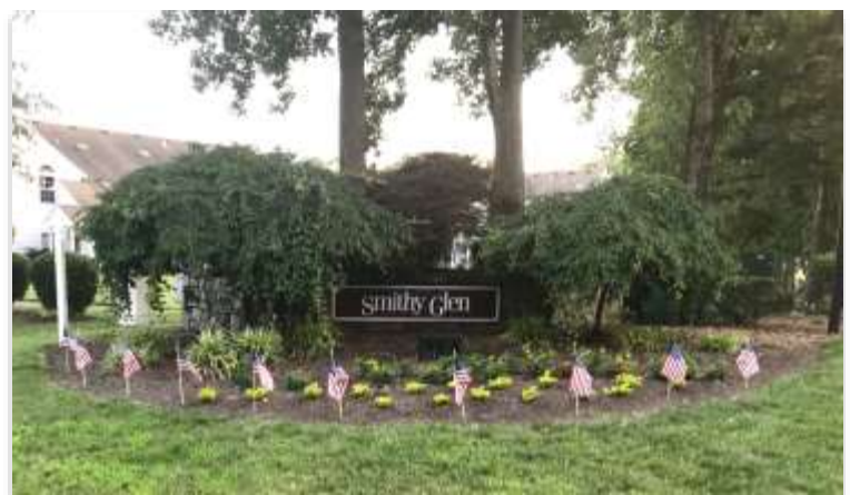
Smithy Glen Monument is Decorated for the 4 th of July

SG Policy Resolution #2022-3, dated 1 Sept 2022 , states that no electric vehicle charging stations will be erected on Smithy Glen property (parking and grass areas). Additionally, no vehicle charging cord shall cross any sidewalk, or visible to any neighboring properties, causing a tripping hazard.