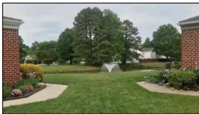
A Beautifully Landscaped area in Smithy Glen.