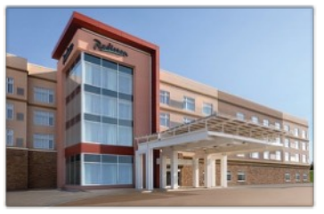
Event Host Hotel: Kingswood Radisson Hotel 41 Kingswood Park