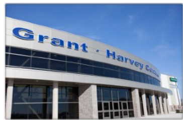
Competition Host Facility: Grant-Harvey Centre 600 Knowledge Park Drive Ice Surface #1: Competition Ice Surface #2: Awards & Market