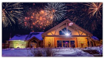
Banquet Location: Kingswood Entertainment Centre & Lodge 31 Kingswood Park