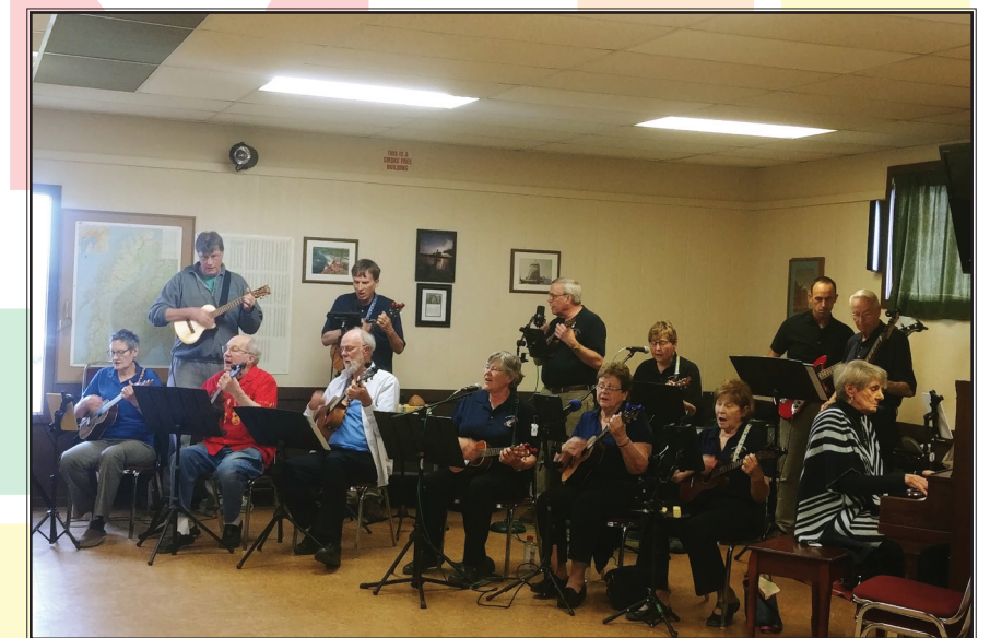
THUG PLAYING TUNES AT BLACK TIE BINGO BACK IN MAY 2019