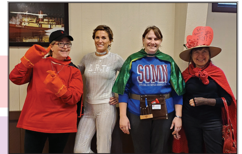
FALL FEST ON OCTOBER 31ST 2019

OUR GROCERY SHOPPERS COME IN ALL AGES! CALL US IF YOU WOULD LIKE TO KNOW MORE ABOUT OUR GROCERY SHOPPING & DELIVERY SERVICE