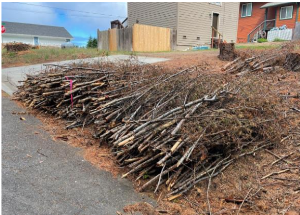
Arrange the stack this way!