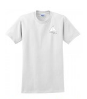
S/S Adult Cotton Tee (Lafayette Sailing Club)