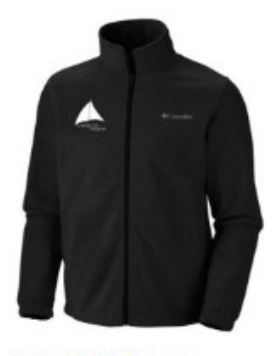
Columbia Men's Steens Mountain Fleece (Lafayette Sailing Club)