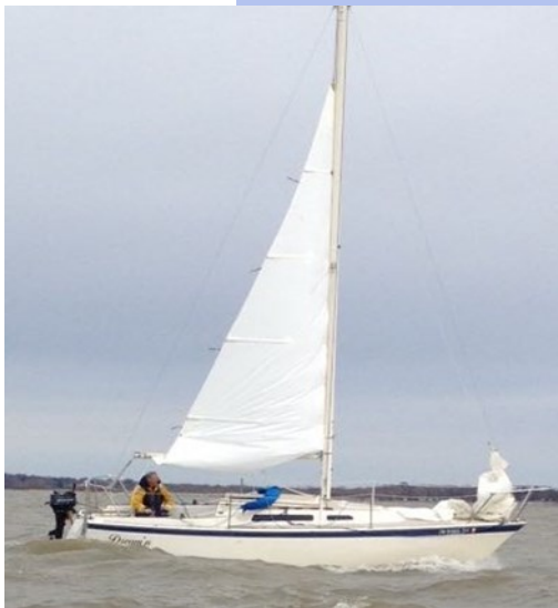
Lewis Wallace sailing on Friday.

The following day, Friday, the weather was just a little worse than OK for March. Winds were at 20 with gusts, white caps on the water, temps in the 40s, but we sailed. The mains were reefed and the jibs were on deck. Both boats sailed nicely. It was a good day.