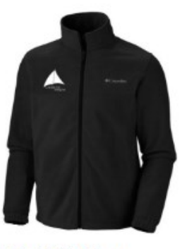
Columbia Men's Steens Mountain Fleece (Lafayette Sailing Club)