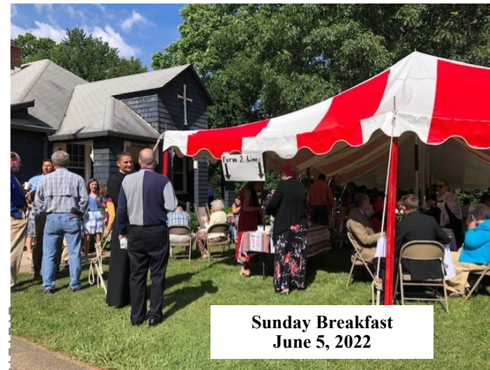
Sunday Breakfast June 5, 2022

We thank our St. Vincent de Paul Society for the delicious breakfast after Sunday's Masses last weekend! The SVdP volunteers did the work and paid for the meal as a sign of their appreciation for your continued support of their ministry.