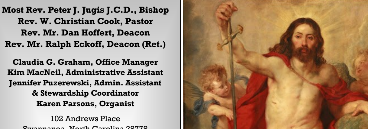
Christ suffered for sins once, the righteous for the sake of the unrighteous, that he might lead you to God. Put to death in the flesh, he was brought to life in the Spirit. ~ 1 Peter 3:18