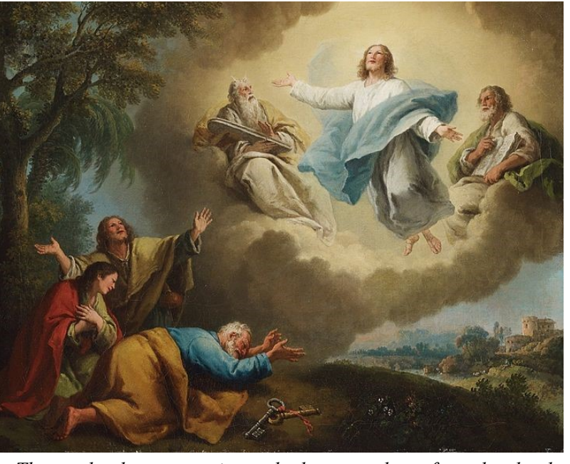
Then a cloud came, casting a shadow over them; from the cloud came a voice, "This is my beloved Son. Listen to him." ~ Mark 9:7

Contact the Faith Formation Team at: stmmcfaith@gmail.com.